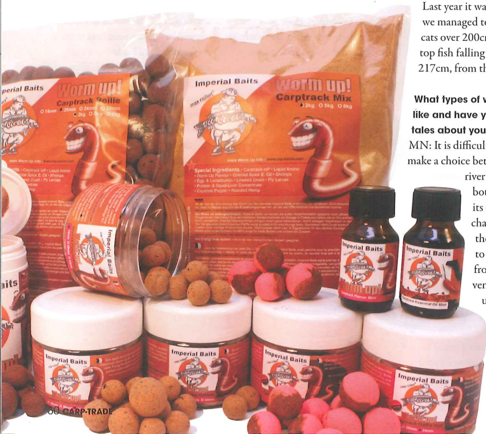
LEFT The very successful Worm Up! Carptack Mix.