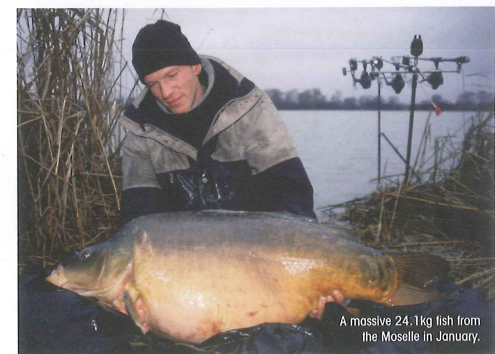
A massive 24.1kg fish from the Moselle in January.