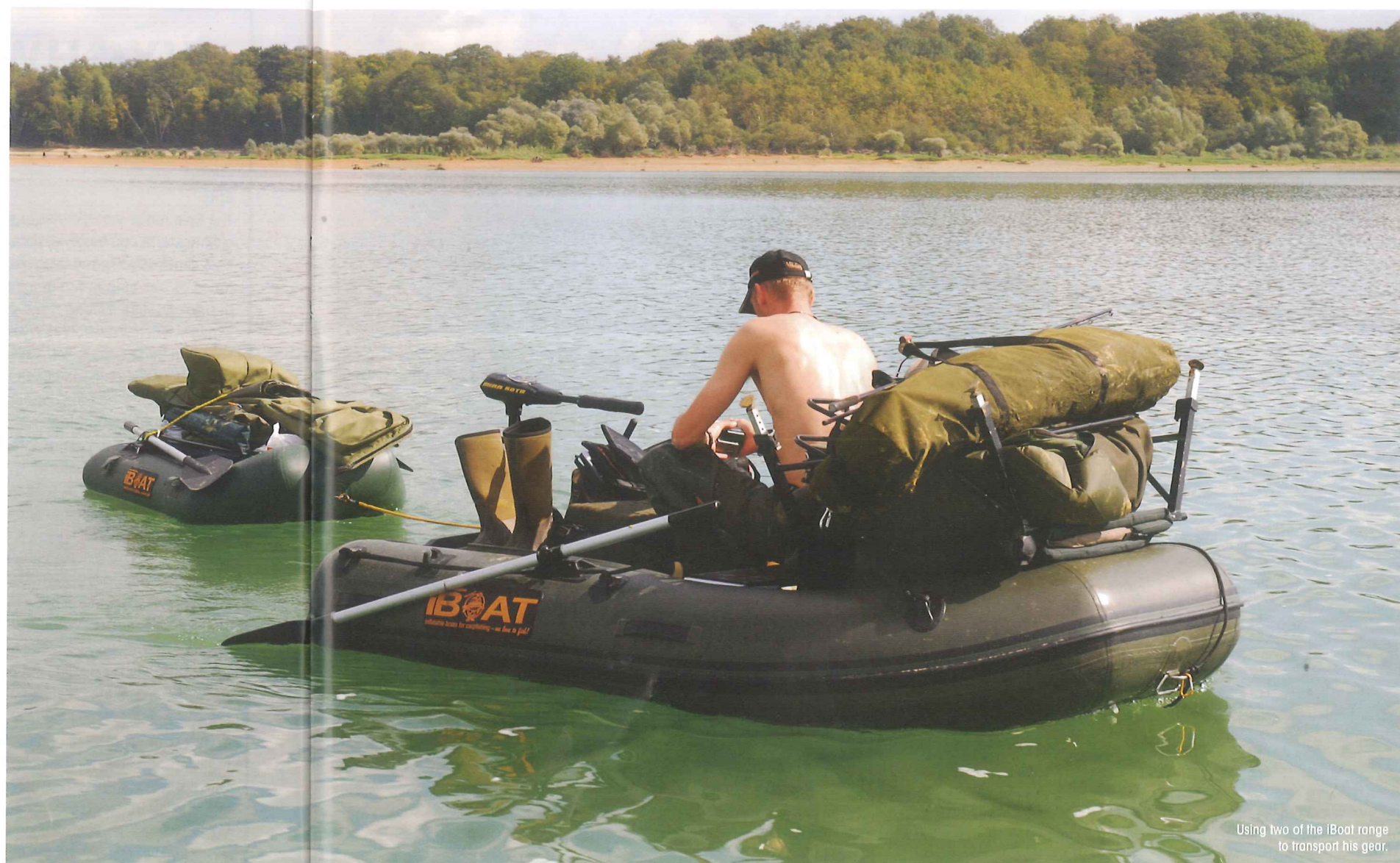
Using two of the iBoat range to transport his gear.

boats for carp fishing. These boats are stable and have loads of interior room. They also inflate easily at low pressure and are made from hard-wearing PVC material Dezitex. The iBoat 400 has been produced primarily for static boat fishing, and is lighter than aluminium, and above all, quieter. The boat has a width of 190cm and plenty of inner space, about 3 x 1m, making it the perfect stable fishing platform. You can even get a purpose-designed boat bivvy to make the package even more versatile.